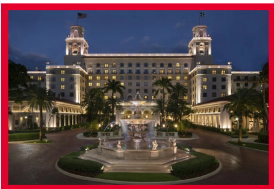
The Breakers, Palm Beach