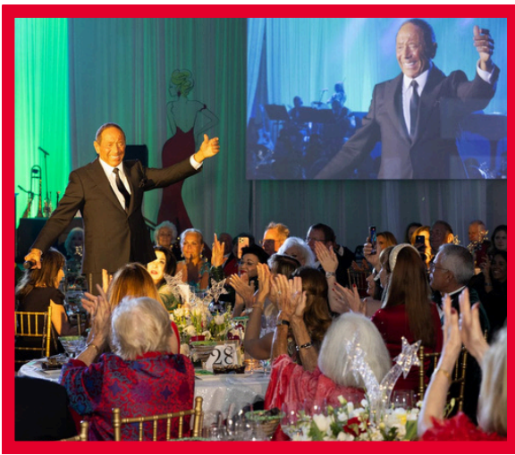
Global music sensation Paul Anka