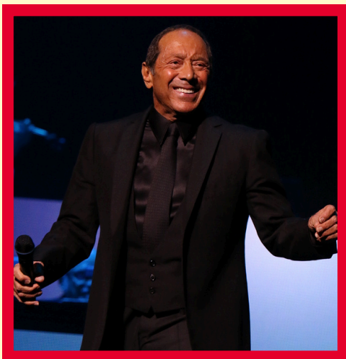
Global superstar singer and songwriter Paul Anka

As I'm sure you are aware, the 2024 Summer Olympics in Paris are well underway. If you're like me, you've been spending some time watching the finest athletes – women and men – from around the world compete in gymnastics, track & field, soccer, tennis, basketball, swimming, and the many other sports that comprise the Olympiad.